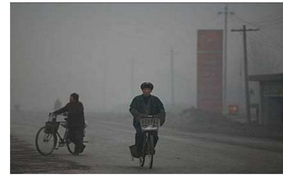
Swiss Centre For Life Cycle Inventories

Knowledge is not the problem We know where the problems are, e.g. deaths from air pollution: